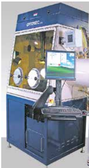
LENS MR-7 System

LENS systems are used in the repair and rapid manufacturing of metal components in state-of-the-art materials such as titanium, stainless steel, and Inconel ® . Use the LENS MR-7 System to rapidly create materials of exceptional quality.