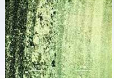
Gradient microstructure produced by the LENS process