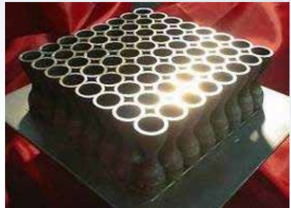
Novel structures created by LENS

The LENS MR-7 system offers a 300mm cubed work envelope, making it ideal for the manufacture or repair of smaller components. LENS systems use energy from a high-power Fiber Laser to build up structures one layer at a time directly from metal powders, alloys, ceramics or composites. The two powder feeders allow gradient materials to be made – every layer can have a different chemistry. This enables new materials to be made and analyzed with extraordinary speed. LENS systems are used throughout the entire product lifecycle for applications ranging from rapid alloy development and functional prototyping to rapid manufacturing or repair.