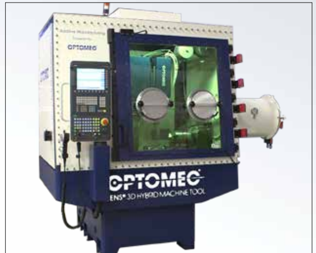
LENS 3D HY 20 CA System. An Additive only model, LENS 3D AM 20, is also available.

Built on a rugged cast iron CNC platform, the system features high precision ball screws, spindle, and ATC for precision machining operations. Additive functionality is enabled with integrated Optomec LENS technology including Steadyflow™ powder feeders, water-cooled LENS processing head with interchangeable powder delivery nozzles, and SmartAM™ closed loop controls. A high power fiber laser and advanced Siemens controls complete the system.