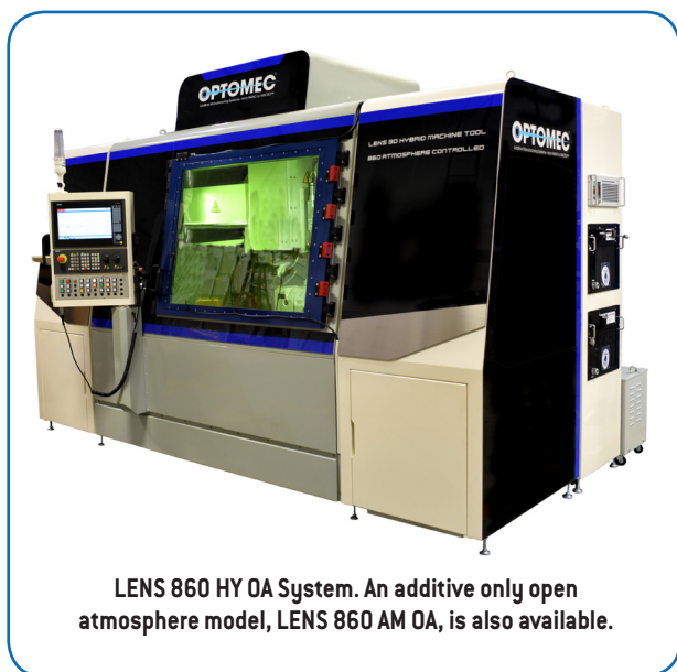
LENS 860 HY OA System. An additive only open atmosphere model, LENS 860 AM OA, is also available.

Larger Work Envelope & Higher Power Bring More Capabilities for Affordable, High Quality Metal Hybrid Manufacturing.