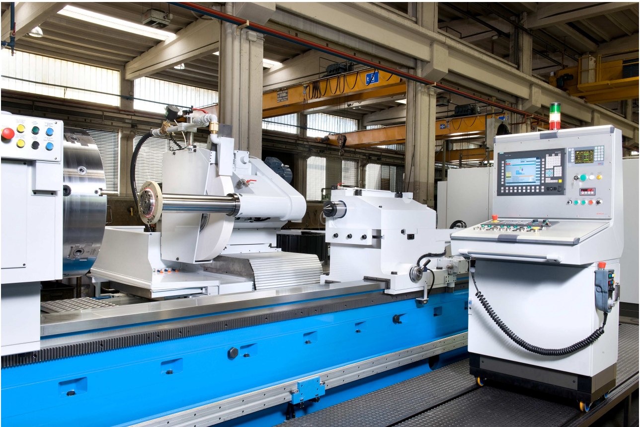
ID grinding attachment in working position.

OD and ID grinding are programmed and managed by the CNC in a fully automatic grinding process.