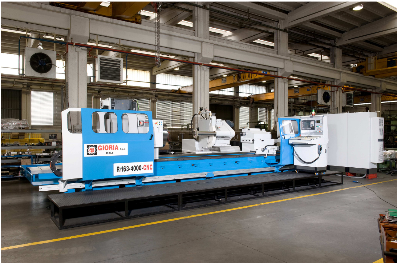
General view of the grinding machine R/163 – 4000 x 600 CNC

This presentation highlights the outcome in taking a such challenge which lead us to produce a truly unique piece of equipment.