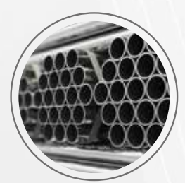
TUBE & PIPE